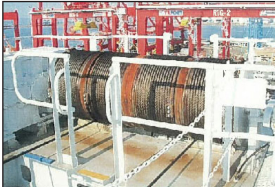
Wire ropes as originally received by customers.